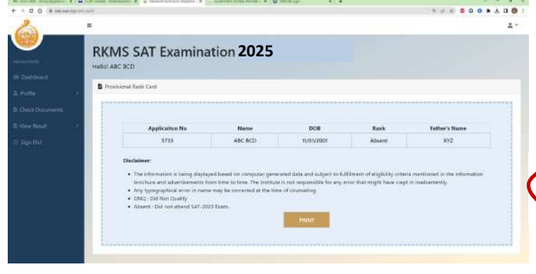
Step 4 : View SAT Result & Print